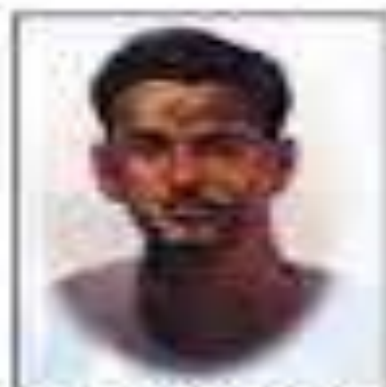
Mohammad Mostafa Kamal (1947-1971)