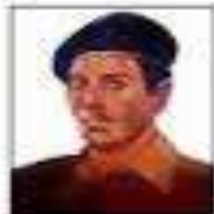
Munshi Abdul Rauf (1943-1971)