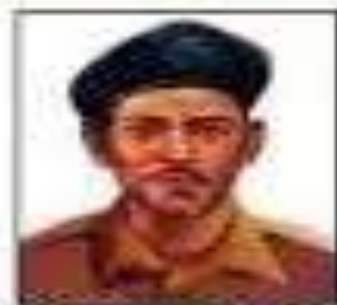
Nur Mohammad Sheikh (1936-1971)