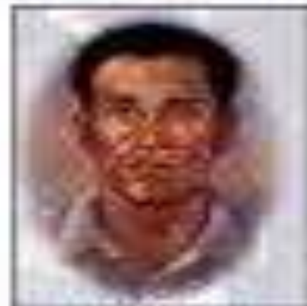
Ruhul Amin (1935-1971)