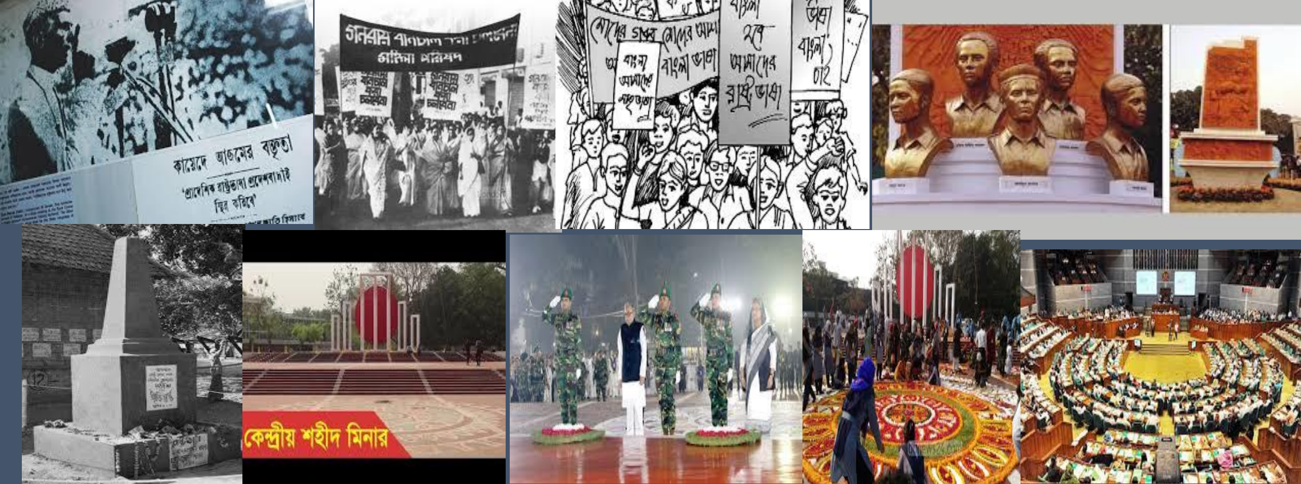
কেন্দ্রীয় শহীদ মিনার